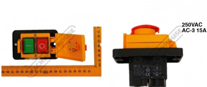
2BC0226 Switch 250V Lid Open