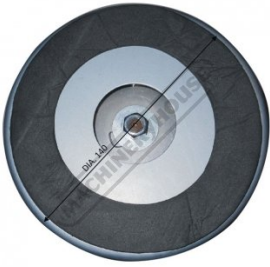
2SC0561 MOTOR (DUST COLLECTOR) NO.56 2