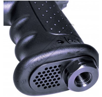
Handle Exhaust with Muffler