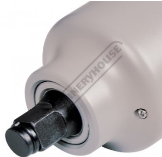
Half Inch Square Drive