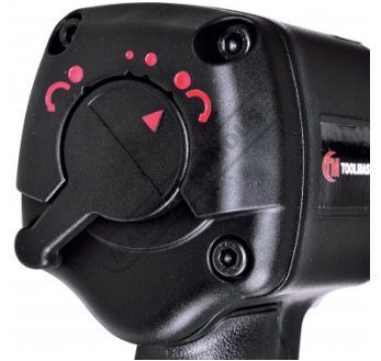
3 Forward and 1 Reverse Speed Selector