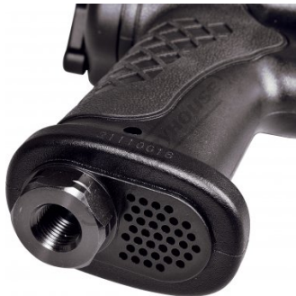
Handle Exhaust with Muffler