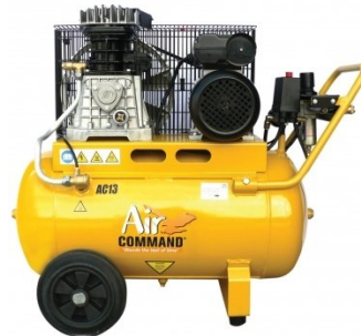
C3118 Air Compressor