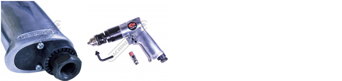
Quiet Handle Exhaust