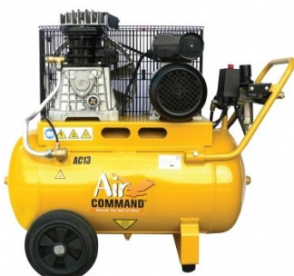
C3118 Air Compressor