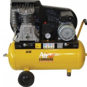
C3124 Air Compressor