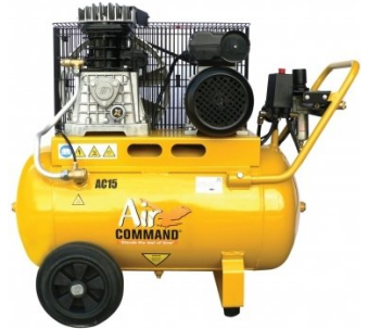
C3120 Air Compressor