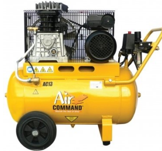
C3118 Air Compressor