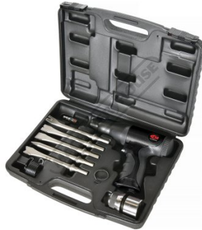
Full Kit In Case