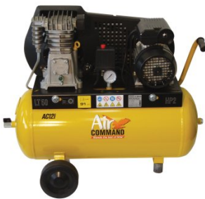
C3122 Air Compressor