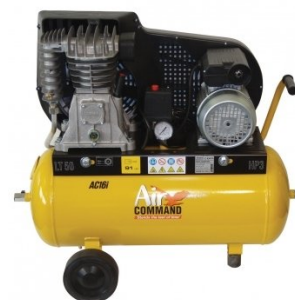
C3124 Air Compressor