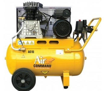
C3120 Air Compressor