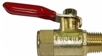
F930 Air Fittings