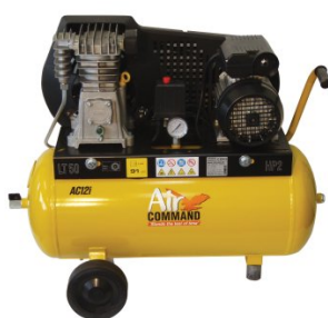
C3122 Air Compressor