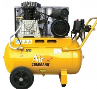
C3118 Air Compressor