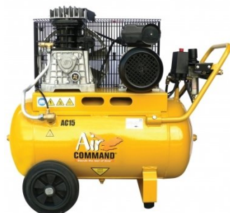
C3120 Air Compressor