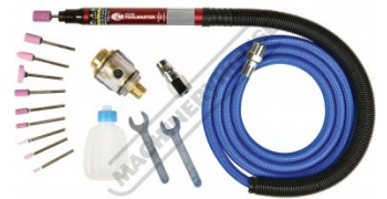
Top View with Parts