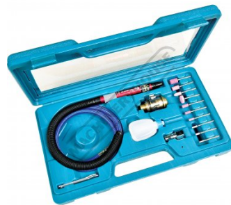
Shown In Plastic Case