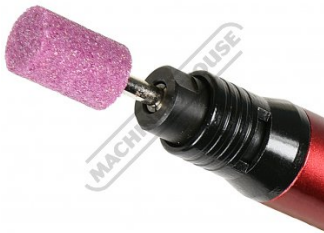
3mm Collet Head