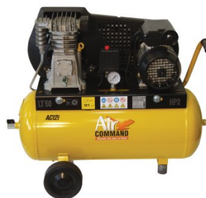
C3122 Air Compressor