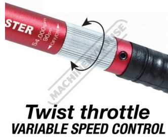
Twist Throttle Variable Speed Control Kit