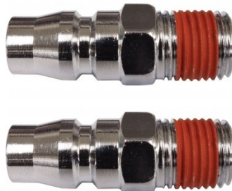
F951 High-Flow Air Fittings