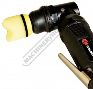
Small Polishing Pad