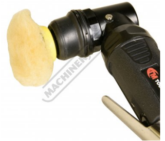
Small Wool Pad