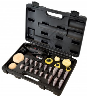
Air Sander Case