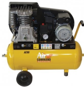
C3124 Air Compressor