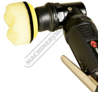
Large Polishing Pad