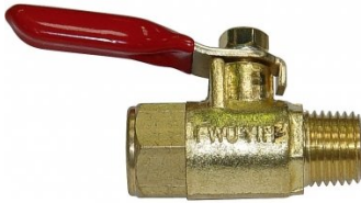
F930 Air Fittings