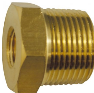
F838 Air Fittings