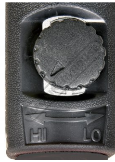
Power Speed Adjustment