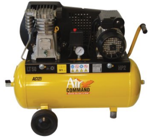
C3122 Air Compressor