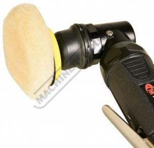
Large Wool Pad