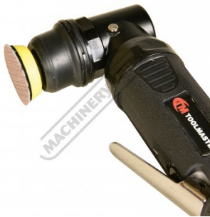
Small Round Sanding Disc