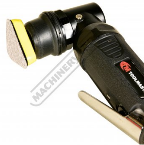
Mini Triangular Sanding Disc