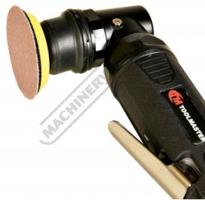
Large Round Sanding Disc