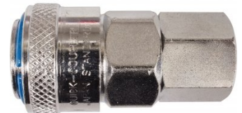
F940 High-Flow One Touch System Air Fittings