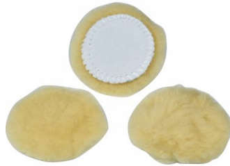
A0569 50mm (2") Wool Polishing Pads