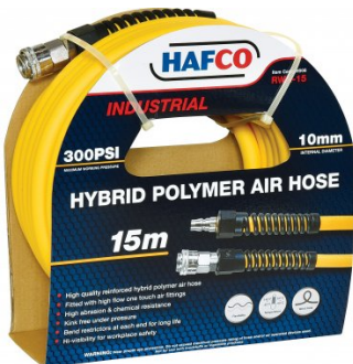
H008 Industrial Polymer Air Hose