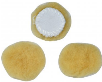
A0565 30mm (1.2") Wool Polishing Pads