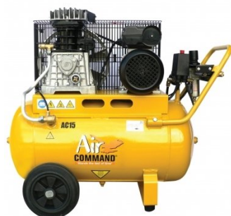
C3120 Air Compressor