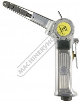
Adjustable Angle Head Left