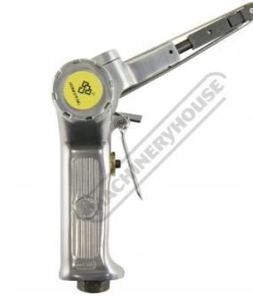
Adjustable Angle Head Right