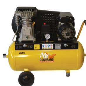
C3122 Air Compressor