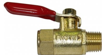
F930 Air Fittings