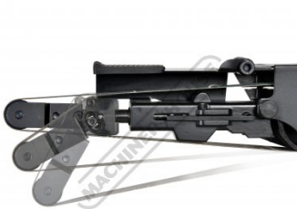
Bendable arm to 55 degrees