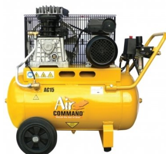
C3120 Air Compressor