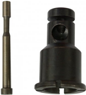
A082A Air Nibbler Cutter Set