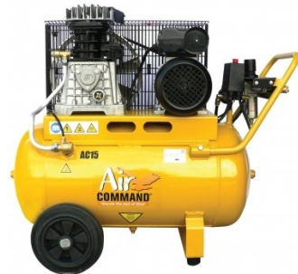
C3120 Air Compressor