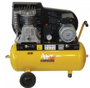
C3124 Air Compressor