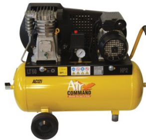
C3122 Air Compressor