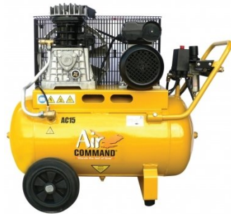
C3120 Air Compressor