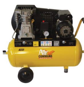
C3122 Air Compressor