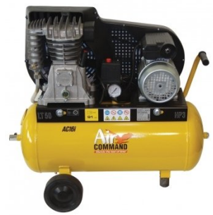
C3124 Air Compressor