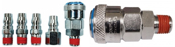
F941 High-Flow One Touch System Air Fittings