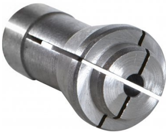
A04225 Die Grinder Collet