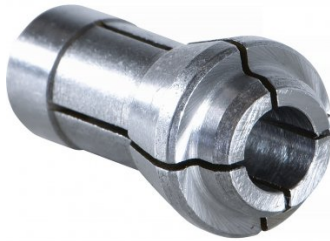
A04226 Die Grinder Collet