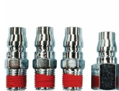
F935 High-Flow Air Fittings