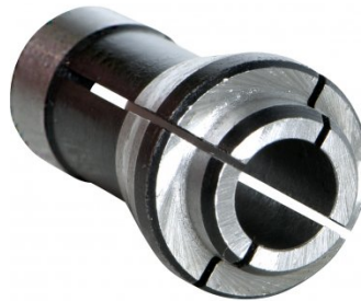
A04227 Die Grinder Collet