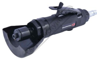
Shown Without Disc