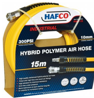
H008 Industrial Polymer Air Hose