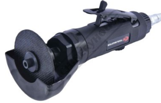
Shown With Disc