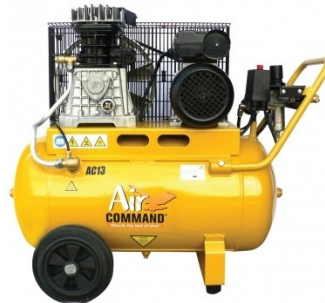
C3118 Air Compressor