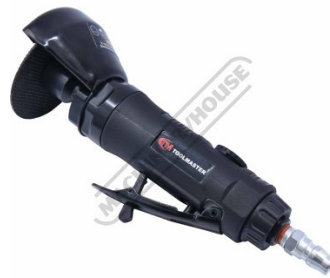
Low Rear View