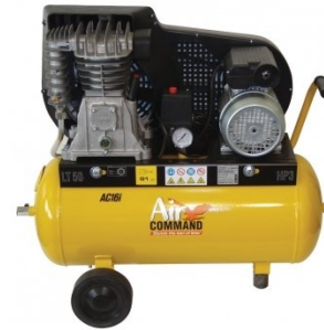
C3124 Air Compressor