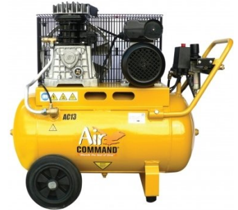
C3118 Air Compressor