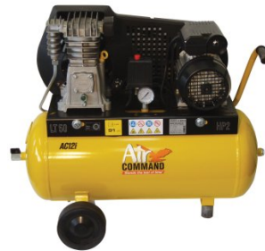
C3122 Air Compressor