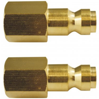
F903B Air Fittings