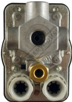
Bottom Of Pressure Switch