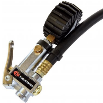
Air Leaver-Release Button