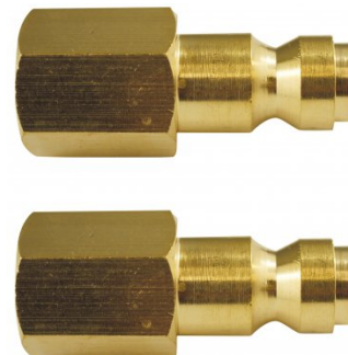
F903B Air Fittings