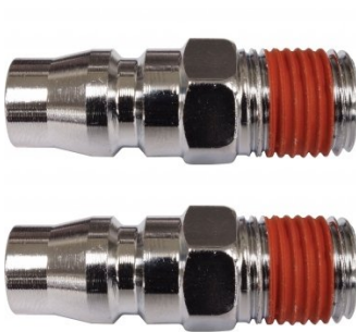
F951 High-Flow Air Fittings