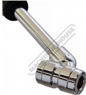
Double Ended Tyre Chuck