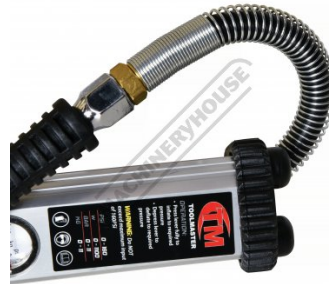
Protective Steel Coil Spring