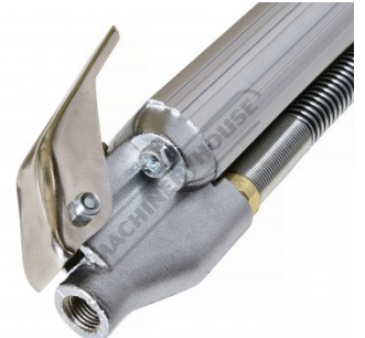
1/4 inch BSPT Inlet