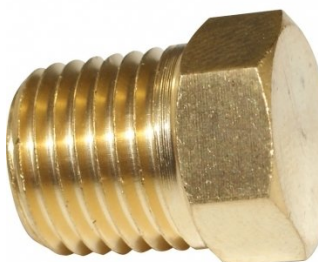
F870 Air Fittings