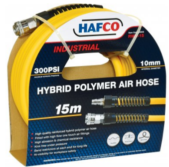
H008 Industrial Polymer Air Hose