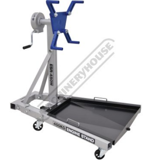
Shown with Optional ESDT 16 Drip Tray A338