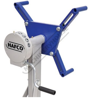
Handle For Geared Rotating Head