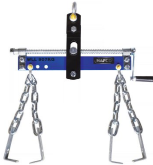
A3425 Engine Tilter - Heavy Duty