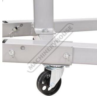
Swivel Caster Wheels