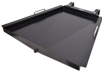
A338 Engine Stand Drip Tray