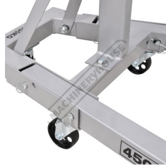
Locking Pins For Legs