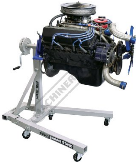
Shown with V8 Engine