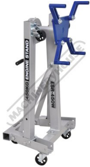
Legs Fold Up For Storage