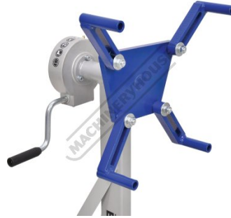
Adjustable Engine Mounting Plate