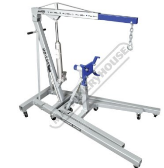
Easy Engine Removal with Optional Engine Crane Front View