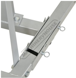
Quick Release Locking Pins on Legs