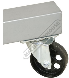
Five Swivel Caster Wheels