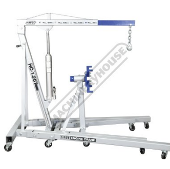
Easy Engine Removal with Optional Engine Crane