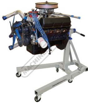
Shown with Ford 351 Engine Mounted