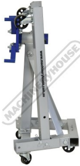
Fold Up Legs-For Easy Storage