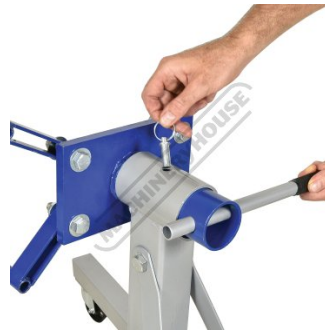
Quick Release-Index Pin for Rotation