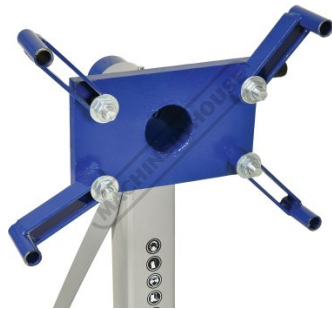
Four Adjustable Mounting Arms