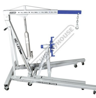
Easy Engine Removal with Optional Engine Crane Top View