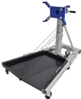
Shown with Optional ES DT 16 Engine Stand Drip Tray A338