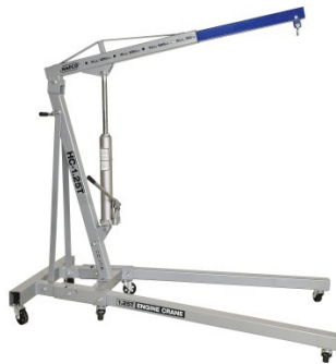
A350 Hydraulic Engine Crane