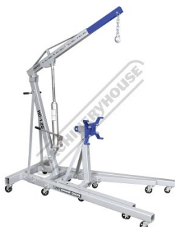
Easy Engine Slots in Perfectly with Optional Engine Crane