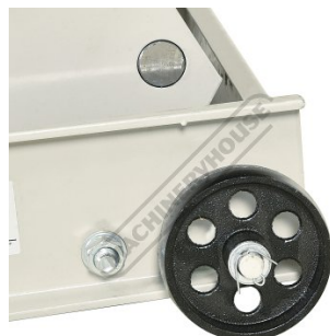
Rear Caster Wheels