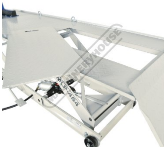
Removable Rear Plate for Maintenance