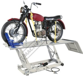
Shown with Optional Motorbike and Straps