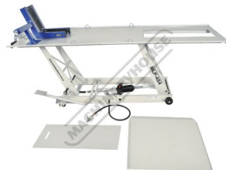
Shown with Mounting Plates Off