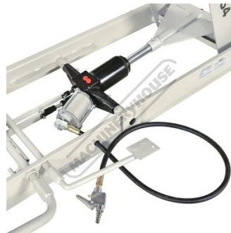
Pneumatic Hydraulic Cylinder and Air Connection