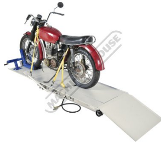
Shown with Optional Motorbike and Straps Rear View