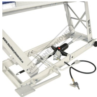
Pneumatic Hydraulic Cylinder