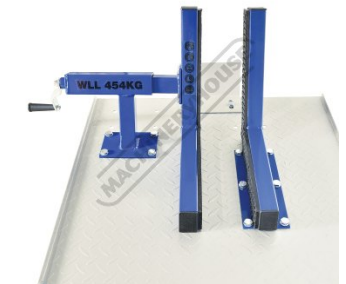
Front Wheel Clamp Adjustment