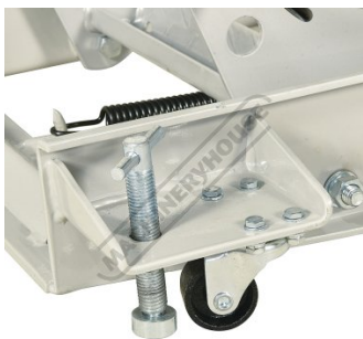
Front Swivel Wheels and Adjustable Stops