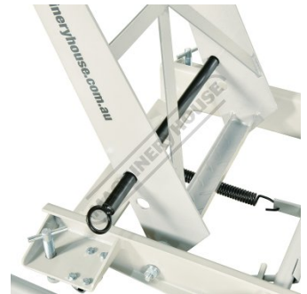
Two Position Safety Locking Bar