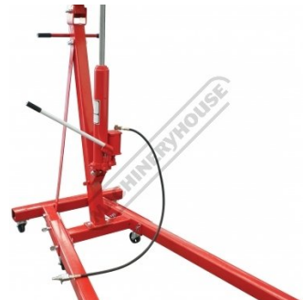
Pneumatic Hydraulic Single Action Ram