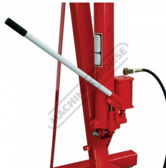
Single Action Manual Pump