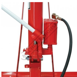
Pneumatic Hydraulic Pump