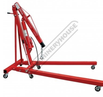
Shown With Ram Fully Down