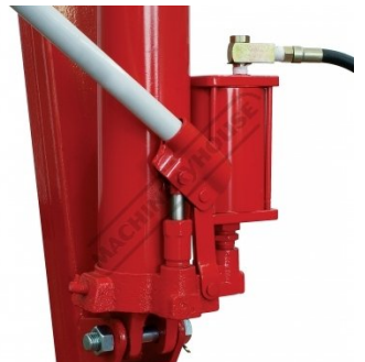
Single Action Pump With Release Valve