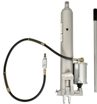
J033 Pneumatic / Hydraulic Ram - Long Stroke with Yoke