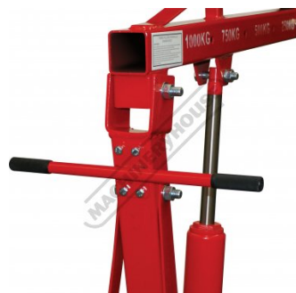
Handle For Easy Manoeuvrability