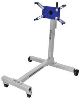
A341 Engine Stand - 450kg Capacity