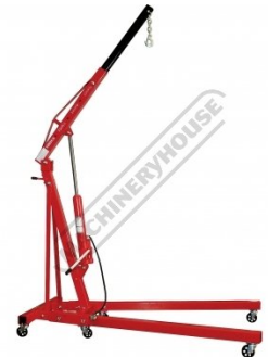
Shown Fully Up and Extended