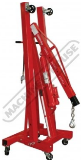
Shown Folded Up