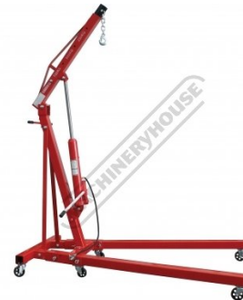
Shown Fully Up