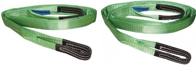
H324 Flat Sling