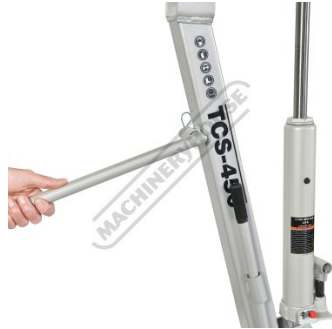
Handle for Swivelling Crane