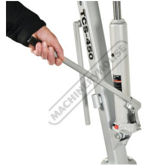
Single Action Hydraulic Pump