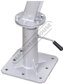
Swivel Base Greaseable with Locking Handle