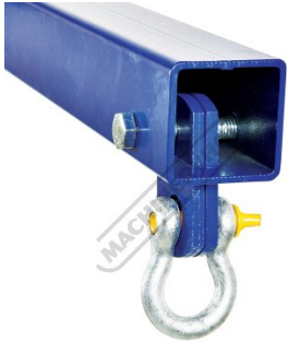
Supplied with Load Rated Bow Shackle