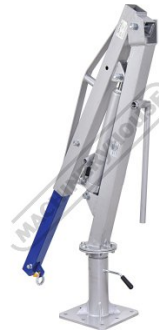
Rear View Fully Down