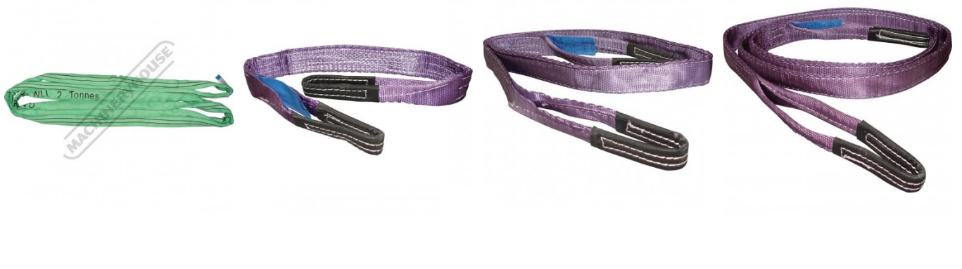
H320 Flat Slings