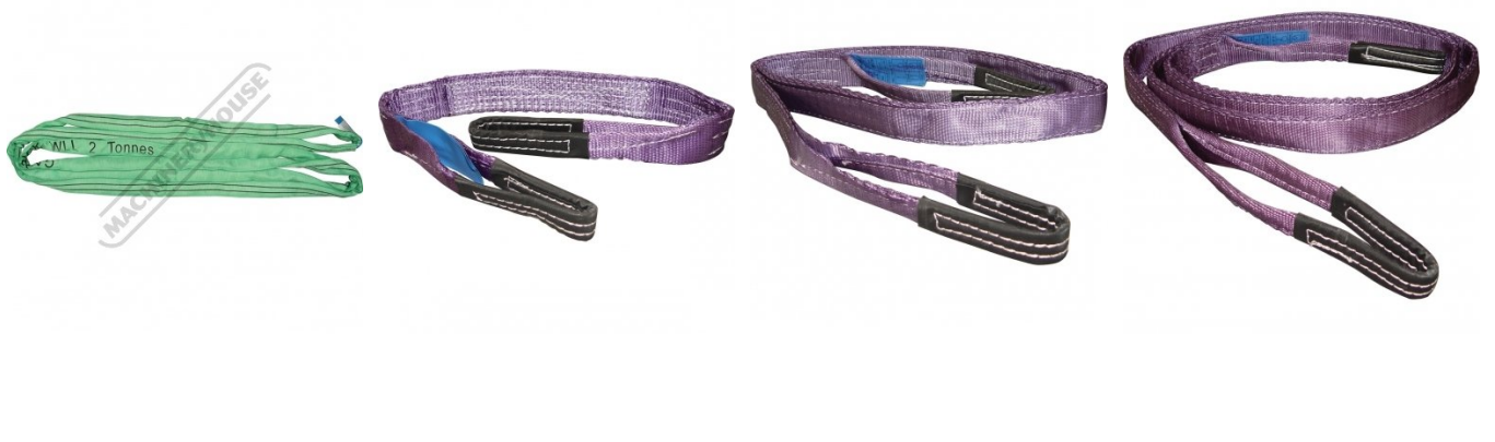
H320 Flat Sling