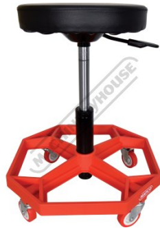
Seat Without Trays