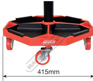
415mm Wide Base