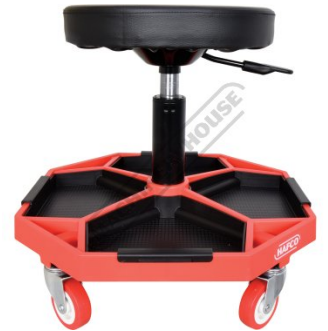
Lowest Seat Height is 410mm