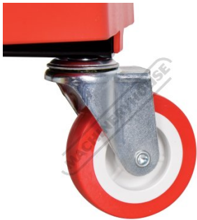
Swivel Caster Wheel