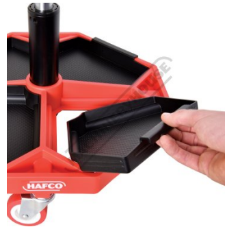
Removable Tools Trays