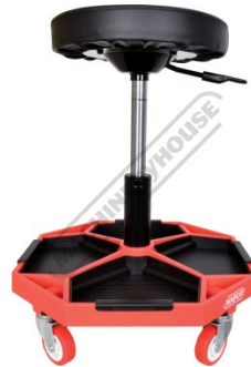
Max Seat Height is 550mm