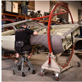
Perfect For Resto Jobs