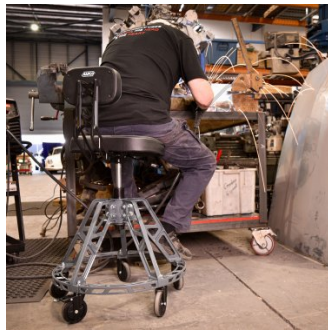
Sit Down Weld All Day