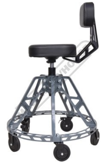
Minimum 660mm Height