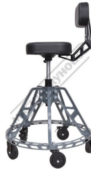
Maximum 760mm Height