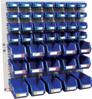
Shown with Optional Buckets on Panels