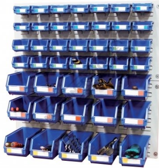
Shown with Optional Buckets and Tools