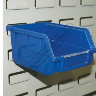
Shown with Optional Buckets