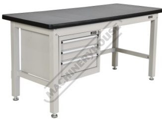
Shown With Optional Table