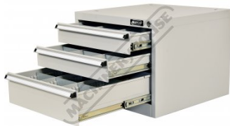
Ball Bearing Slides