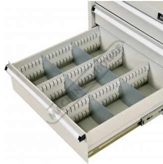
Draws with Steel Dividers