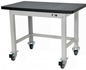
A401 Mobile Work Bench