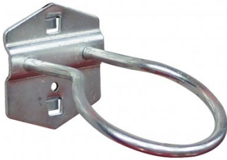
A444 Plier Holder - Triple Prong