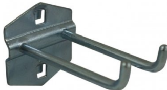
A442 Hook - Double Prong