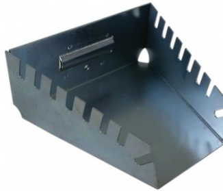
A448 Holder - Screwdriver