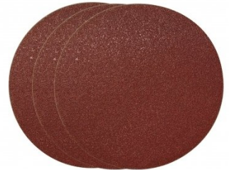
A5332 60G x 178mm (7") Aluminium Oxide Sanding Disc Pack