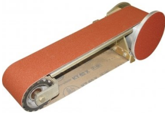
L089 Multitool Belt & Disc Linishing Attachment