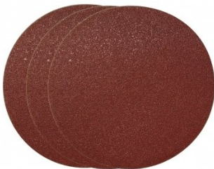
A5334 100G x 178mm (7") Aluminium Oxide Sanding Disc Pack