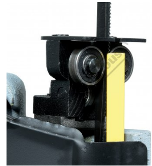
Rear Ball Bearing Blade Guides