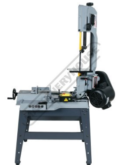
Shown with Vertical Cutting Table