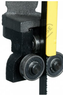
Front Ball Bearing Blade Guides