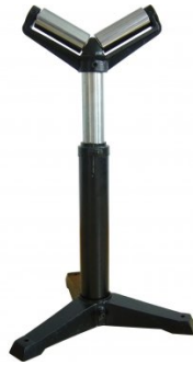
W3436 Roller Stand - V-Type