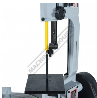
Vertical Cutting Table Close Up