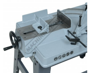
Vice Clamping Fixture