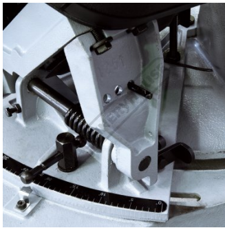
Adjustable Spring To Set Cutting Beam Force