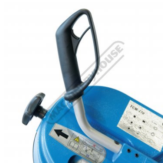
Blade Trigger on/off Switch