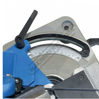
Swivel Head Angle Scale