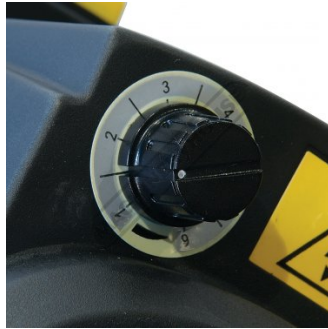
Variable Speed Dial