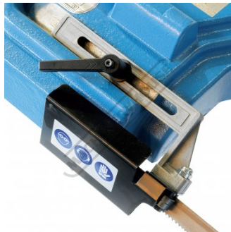
Blade Guide Adjustment