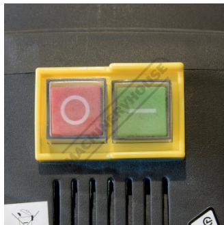
Main Power Switch