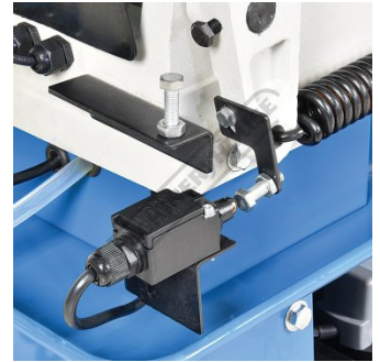
Micro Cut Switch