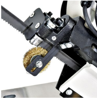
Blade Guide with Cleaning Brush