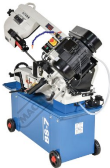
Left View Head Fully Down