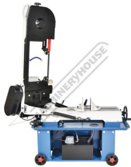
Rear View Fully Raised