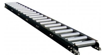
L812 Roller Conveyor