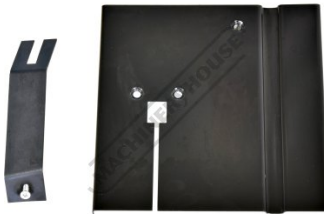
Vertical Cutting Table Parts