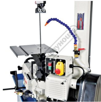
Vertical Cutting Table Rear View