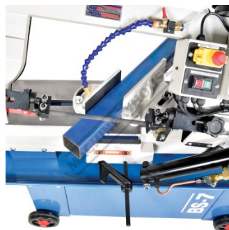
Vice at 45 Degree