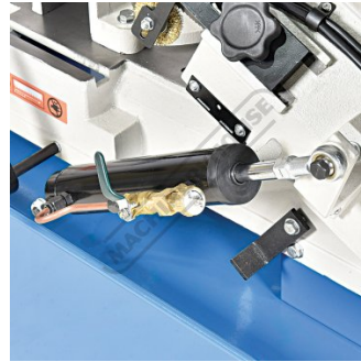
Hydraulic Ram For Down Feed Control