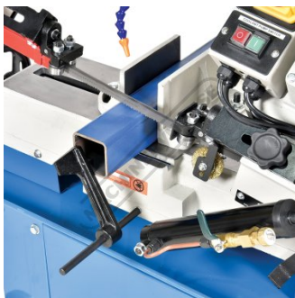
Vice At 90 Degrees