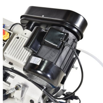
Heavy Duty 1HP 240V Motor