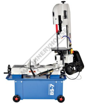
Vertical Cutting Table Front View