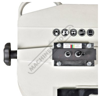
Blade Tension Adjustment Handle