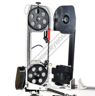
Blade Cover Open