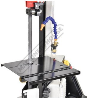
Vertical Cutting Table