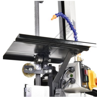
Vertical Cutting Table Fitted