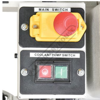
Main Switch and Coolant Pump Switch