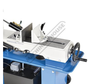
Swivel Vice With Handle Wheel