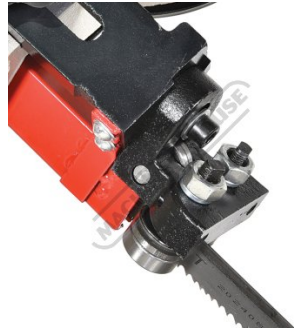
Adjustable Blade Roller Guides