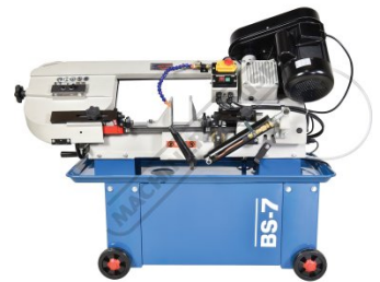
Front View Arm Fully Down