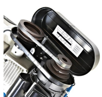
4 Speed Belt Drive System with Safety Micro Switch