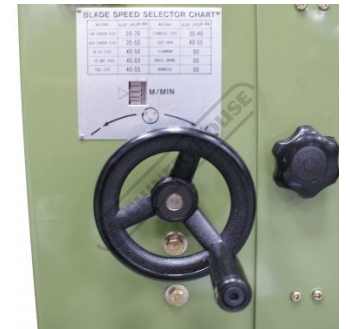
Variable Speed Handle