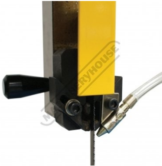
Adjustable Blade Guides and Air Pump