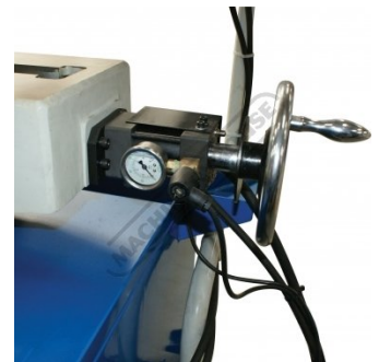
Hydraulic Vice Rear