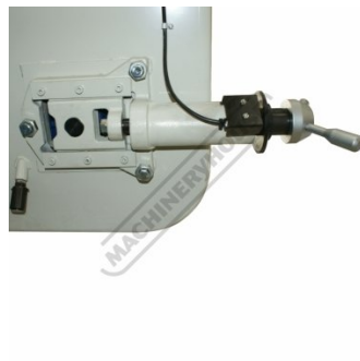
Blade Breakage Rear