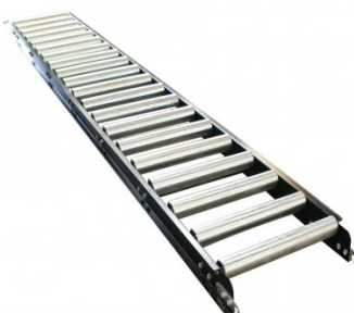
L818 Roller Conveyor