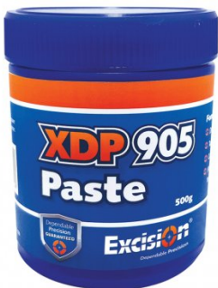
S074 Cutting Tool Lubricant Paste - 500g