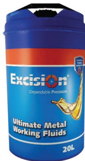
S091 Soluble Metal Cutting Fluid - 20 Litre