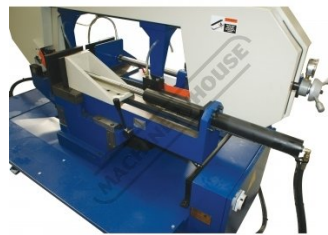
Full Stroke Hydraulic Clamping Vice