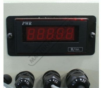
Digital Blade Speed Display