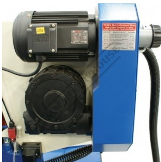
Heavy Duty Gearbox