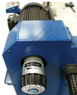
Variable Blade Speed