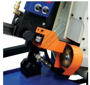
Blade Guides and Blade Cleaning Brush