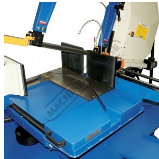
Vice Dual Mitre