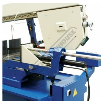
Vice Rear View