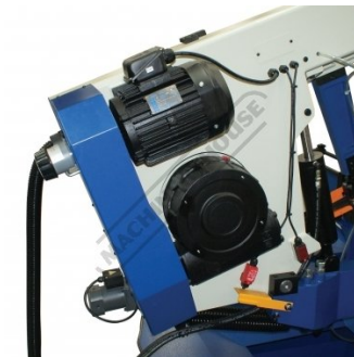
Gearbox and Motor