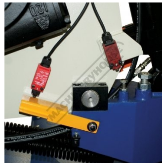
Micro Switches Control on Head