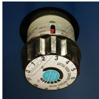
Variable Blade Speed