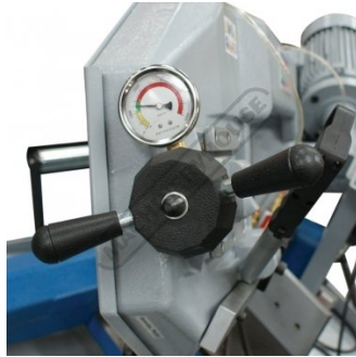
Blade Tension Gauge