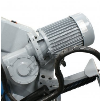
Motor and Gearbox Drive