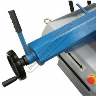
Quick Action Clamp Lever