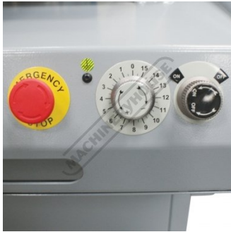
Adjustable Automatic Feed