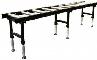
L830 Roller Conveyor with Adjustable Stands - Heavy Duty