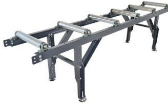
L835 Roller Conveyor with Adjustable Stands - Extra Heavy Duty