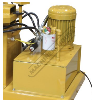
Industrial Grade Low Pressure Hydraulic System