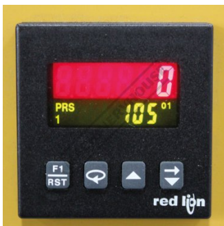
Digital Auto Stop