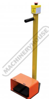
Foot Control Emergency Stop