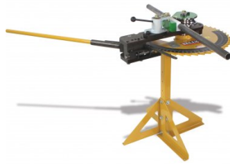
B8075 Hydraulic Pipe & Tube Rotary Draw Bender