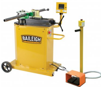
B8085 Motorised Pipe & Tube Rotary Draw Bender