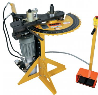
B8075 Hydraulic Pipe & Tube Rotary Draw Bender