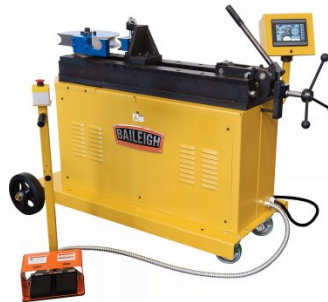
B8100 Motorised Pipe & Tube Rotary Draw Bender