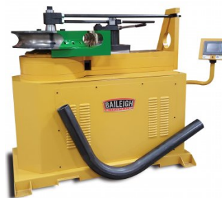
B8100 Motorised Pipe & Tube Rotary Draw Bender