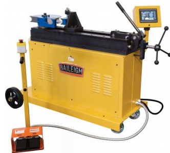
B8100 Motorised Pipe & Tube Rotary Draw Bender