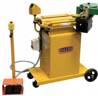
B8085 Motorised Pipe & Tube Rotary Draw Bender