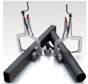
W1012 Adjustable Corner Clamping Plier Set