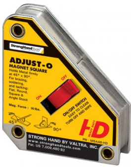
W1007 Adjust-O Magnet Square - Heavy Duty