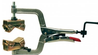
W1014 Pipe Plier - Large