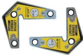
W1010 Corner Magnets - (2-Pack)