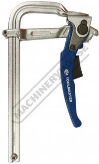
Shown Fully Closed