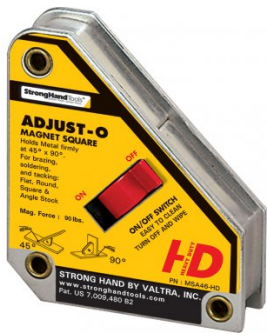
W1007 Adjust-O Magnet Square - Heavy Duty