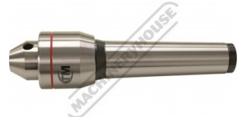
Live Centre Side View