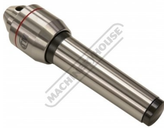
Live Centre Rear View