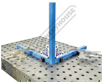
Square Tube Setup with Optional Stops Clamps and Magnetic Squares