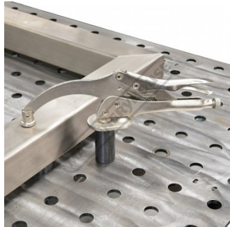
Shown Screwed into Optional Weld Riser W08515