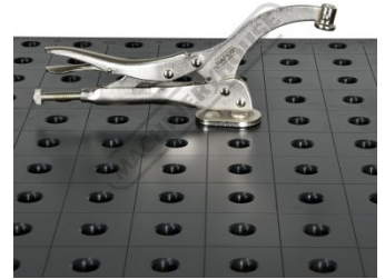
Shown on Welding Table Jaw Open