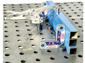
Square Tube Setup with Clamp on Optional Riser