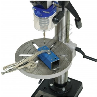
Shown Clamping Job on an Optional Drilling Machine Close Up