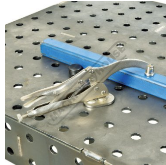
Shown Clamping Square Tube