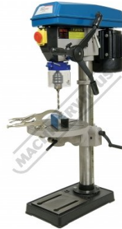
Shown Clamping Job on an Optional Drilling Machine