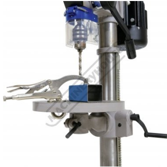
Shown Clamping Job on an Optional Drilling Machine Low View