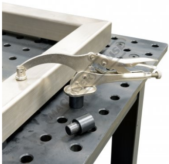
Shown Screwed into Optional Weld Clamp Adaptor W08512